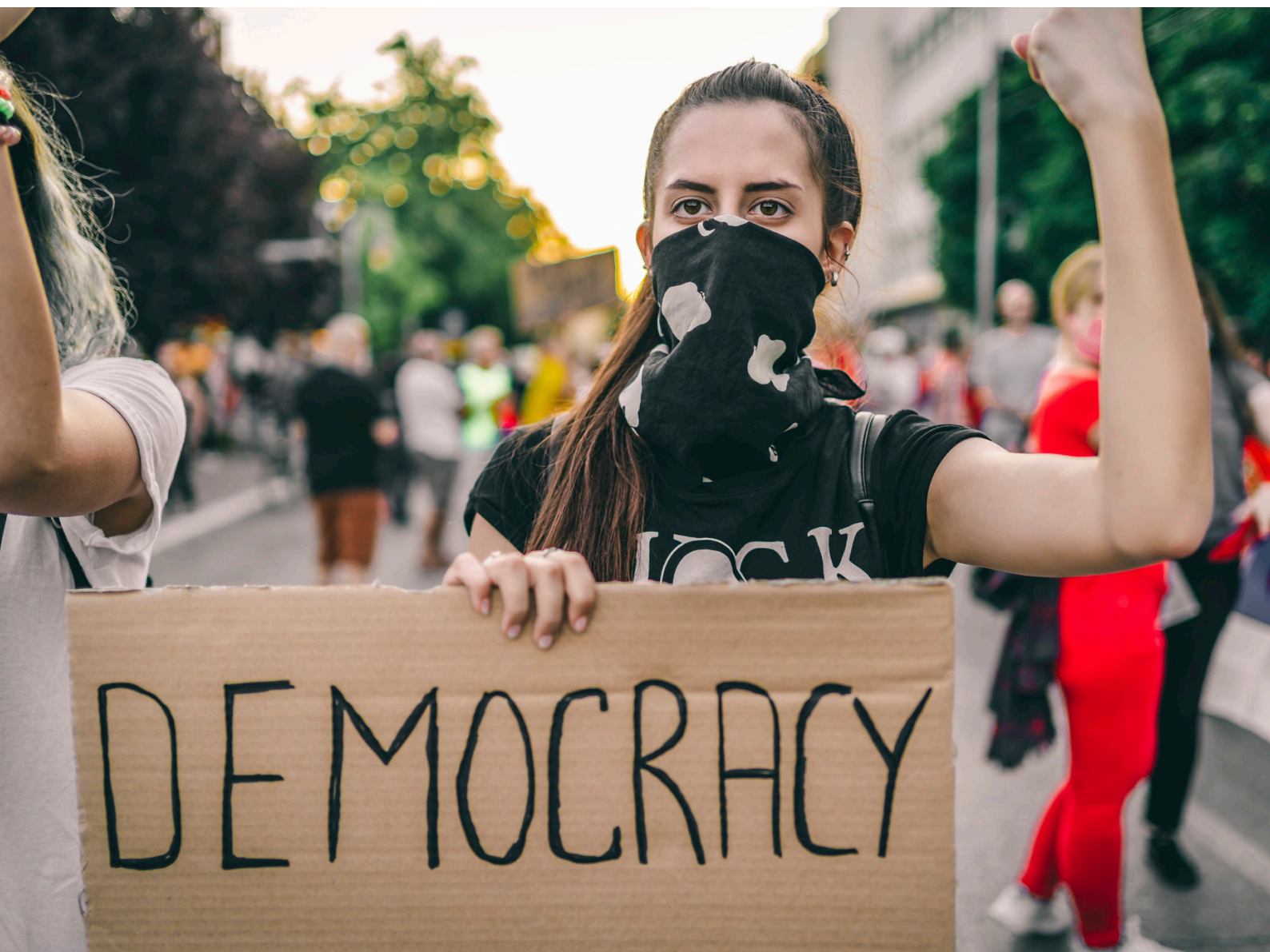
PHOTO CREDITS: All portrait photos of the Rafto laureates: Photographer Hans Jørgen Brun. Illustration photos: Istockphoto.com